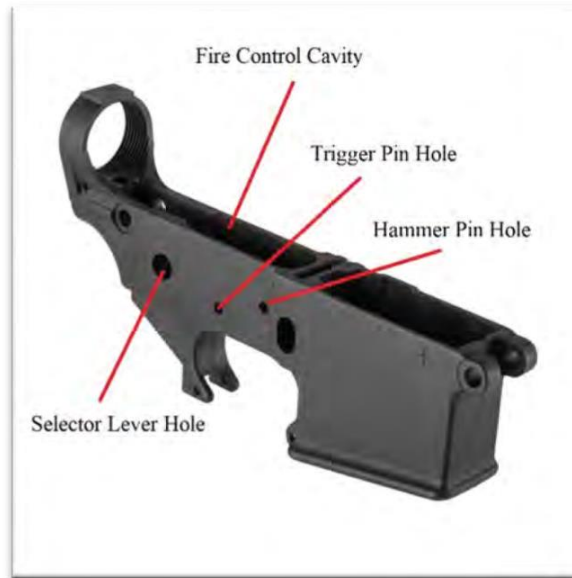
Figure 4: Description of the control cavity and where pin holes should be drilled