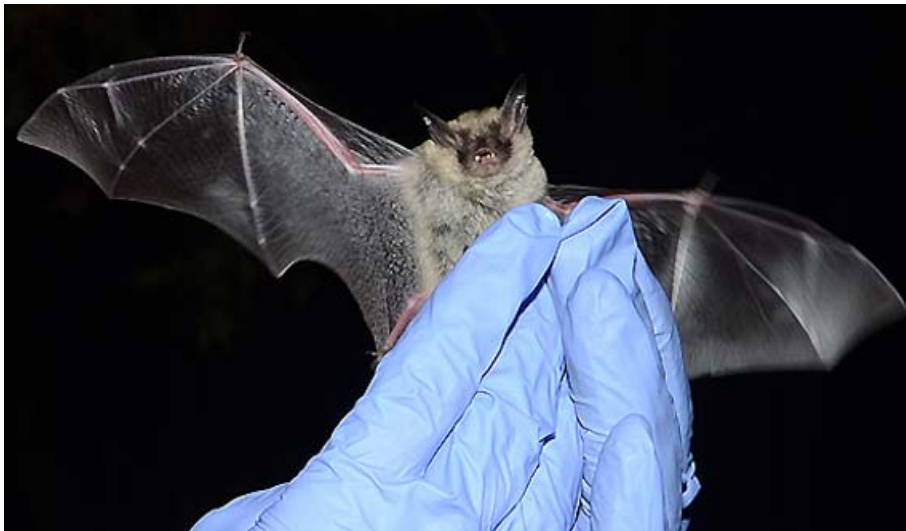
Northern Long-Eared Bat.

97. Northern long-eared bats depend on intact forest habitat, unfragmented by roads or large clearings, for roosting and foraging, and they prefer to roost and forage near rivers and stream corridors. The bat's low length-to-width wing ratio allows it to maneuver well in forests, and it is well adapted to coniferous forests of red spruce and pine. In addition to foraging on the wing, northern long-eared bats can detect insects within trees and on branches. Northern long-eared bats typically live in colonies of 30 to 100 bats in cave hibernacula and often utilize mines and culverts for hibernacula and roosting sites. Females produce at most one pup per year.