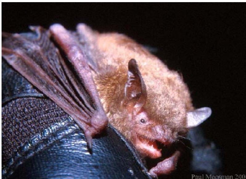
Indiana Bat.

108. In winter, Indiana bats hibernate in caves and mines. The 2019 winter census estimated that the population consisted of 537,297 bats occurring within 223 hibernacula in 16 states, including West Virginia.