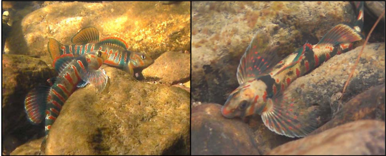
Two views of adult male candy darters sheltering eggs among rocky bottom substrate.

86. Historically, the candy darter occurred in 35 populations across the Bluestone, Lower New River, Upper Gauley, Lower Gauley, and Middle New watersheds in the Appalachian Plateaus physiographic province and the Upper New River and Greenbrier watersheds in the Valley and Ridge physiographic province.