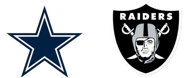
3. In a competitive market, each Team would compete to sell NFL Licensed Products to the greatest number of fans—not only to realize profit but as a self-serving marketing tool; fans wearing NFL License Products are walking billboards.

2. Each of the 32 Teams sells merchandise emblazoned with their team's intellectual property, such as their names and logos ("NFL Licensed Products"). For example, the Dallas Cowboys have the blue star, and the Las Vegas Raiders have the helmeted pirate.