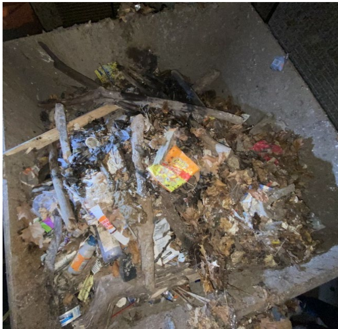
Cheetos snack wrapper in the hopper at the Hamburg Drain Floatables Control Facility, observed December 14, 2022.

79. The accumulation of single-use plastic waste in the Buffalo River, to which PepsiCo substantially contributes, is also a factor in the ongoing need for the Hamburg drain system, constructed and operated at great public expense. Nearly half of branded trash items observed during two site visits to the Hamburg Drain Floatables Control Facility were plastic beverage bottles or plastic snack food wrappers produced by PepsiCo.