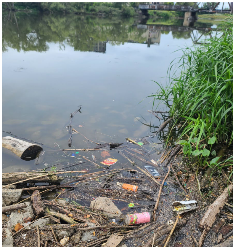
Plastic pollution, including a Fritos snack wrapper produced by PepsiCo, on the shoreline of the Buffalo River at Red Jacket Natural Habitat Park. Observed September 8, 2023.

78. To counter the negative effects of plastic pollution, and in the face of PepsiCo's failure to abate the harms caused by plastic pollution, the public has undertaken costly measures to reduce the quantity of plastic pollution in and around the Buffalo River. For instance, as a part of the redevelopment of Buffalo's Inner Harbor, the Buffalo Sewer Authority was awarded $8.6 million in funding through the American Recovery and Reinvestment Act to support the construction of the Hamburg Drain Floatables Control Facility, estimated to cost $18 million. This facility is designed to capture floatable waste, a significant portion of which is plastic pollution, from twenty sewer regulators within the Hamburg drain system before it gets to Canalside, a newly created and popular tourist destination at the mouth of the Buffalo River.