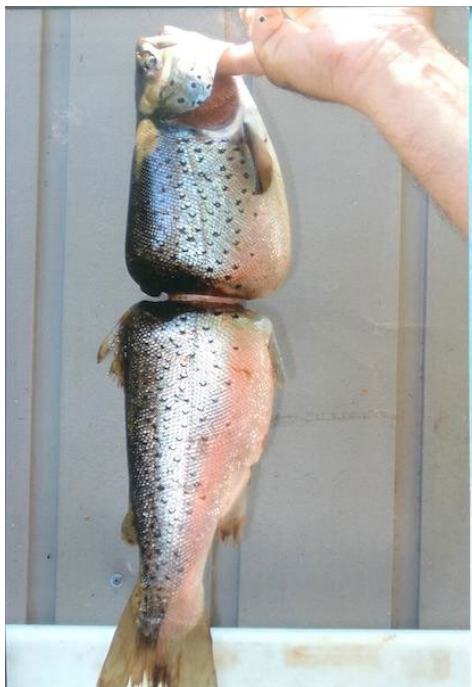
A rainbow trout, a species that also inhabits the Buffalo River, captured in Lake Ontario deformed by a plastic bottle ring.

on the Buffalo River or its tributaries and are commonly eaten by humans and other animals.