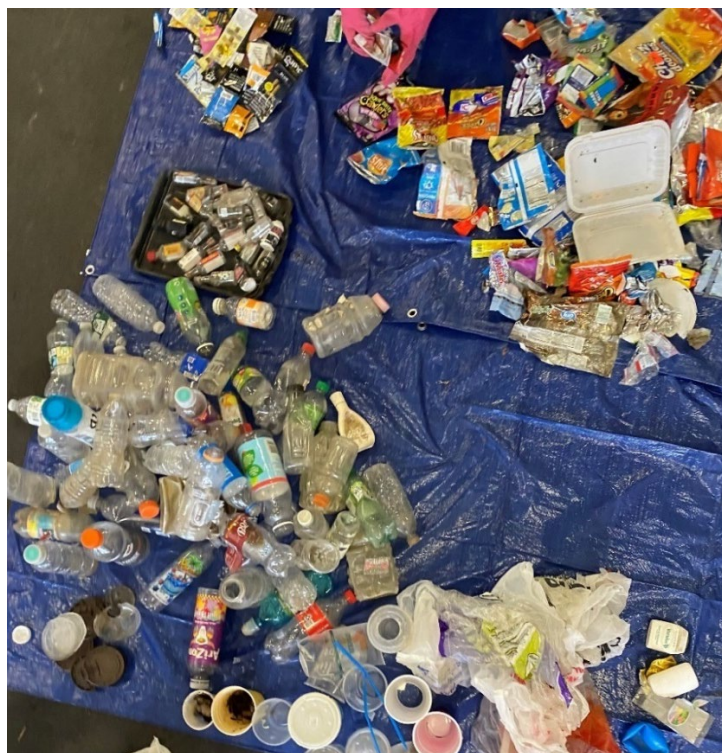
Plastic waste collected in April 2022 from the Erie Basin Marina in the City of Buffalo, including Gatorade bottles and Lay's potato chip packaging produced by PepsiCo.

1. Year after year, plastic packaging amasses on the shores of the Buffalo River. Single-use plastic beverage bottles, bottle caps, and snack food wrappers, of the type manufactured, distributed, and sold by PepsiCo, are collectively the most abundant forms of plastic waste along the shores of the Buffalo River, and PepsiCo is the single largest identifiable contributor to this plastic waste.