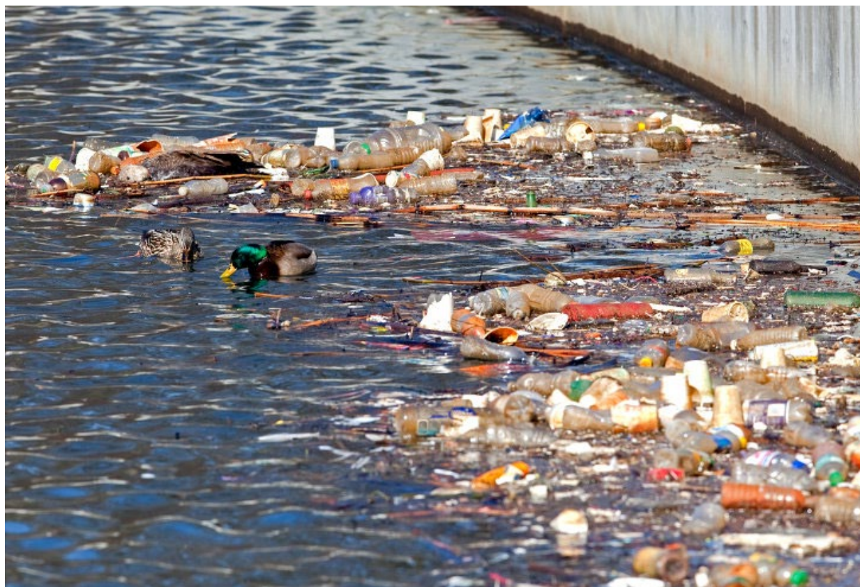
Mallard ducks feeding in a mass of floating waste.

71. Birds that inhabit the Buffalo River and its environs, such as mallard ducks, loons, and cormorants, are known to ingest plastic pollution, mistaking it for food. As a consequence, they can suffer from weakness, irritation of the stomach lining, digestive tract blockage, internal bleeding, abrasion, ulcers, failure to put on fat stores necessary for migration and reproduction, absorption of toxins, and even potential death through starvation.