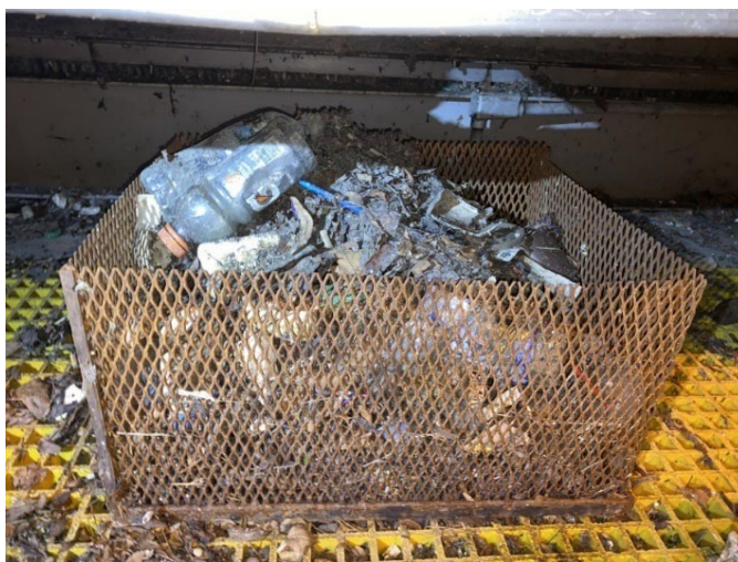
Gatorade plastic bottle on the conveyer belt at the Hamburg Drain Floatables Control Facility, observed December 14, 2022.