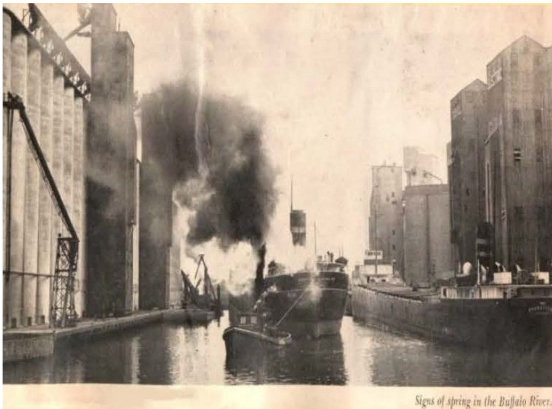
The Buffalo River in April 1951.

30. The Buffalo River was once considered one of the most polluted rivers in the United States. Discharges from grain milling and manufacturing industries that operated along the river in the late 1800s and at the turn of the century, along with chemical and sewer discharges, had so polluted the river that it was devoid of fish by the 1920s. Extensive dredging to deepen and widen the river for navigation during this time also damaged the river's ecosystem. As late as the 1960s, the river was considered biologically dead.