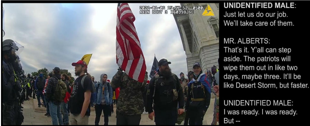
Government Image 3