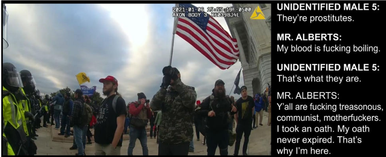
Government Image 1