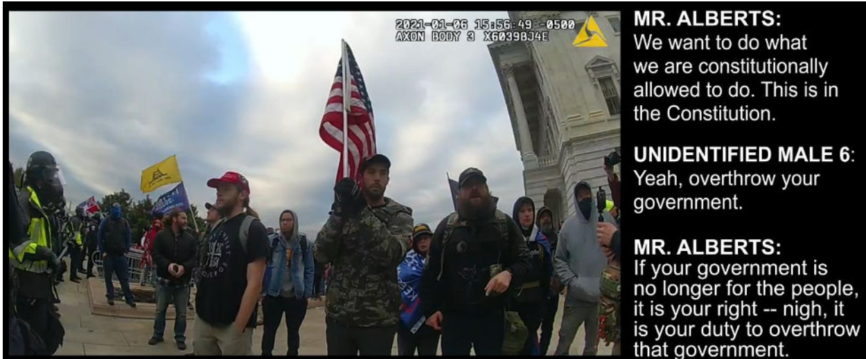
Government Image 2