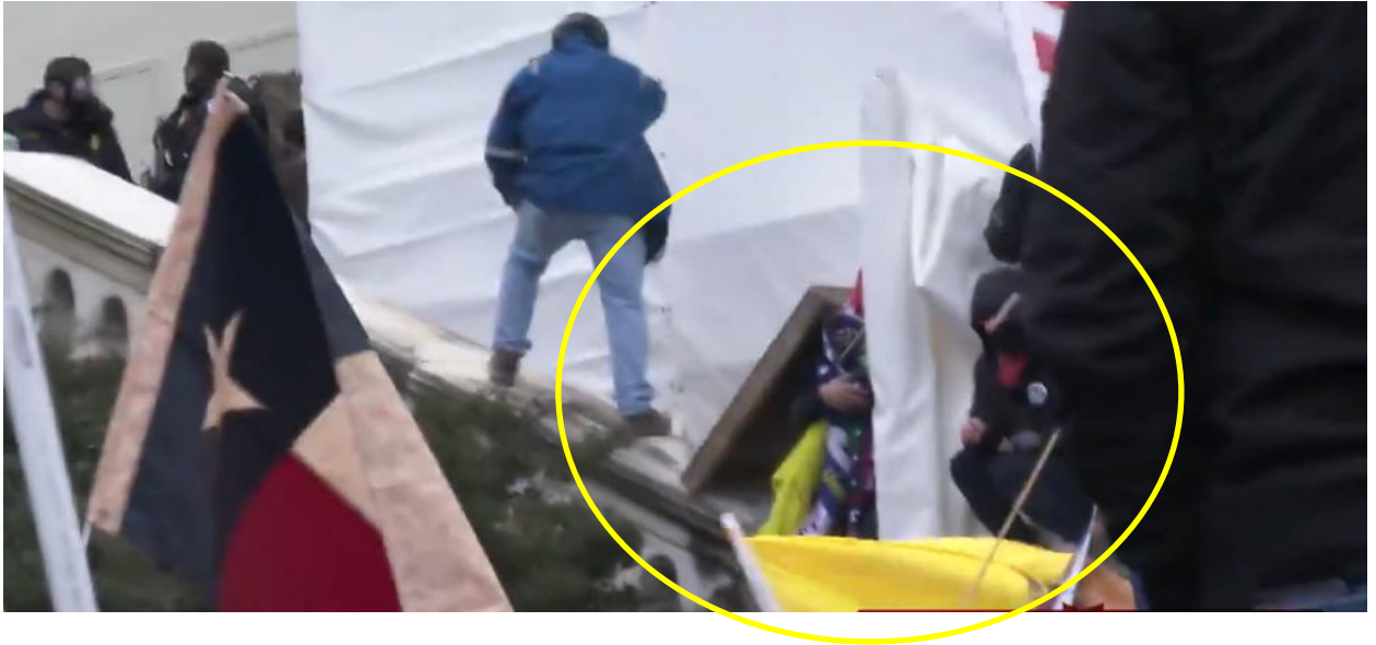
Government Image 6

location. See Government Image Exhibit 6 showing another rioter with the wooden pallet in a defensive position.