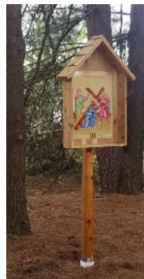
Station of the Cross

The displays do not undermine any of the Township’s stated objectives for restricting signage. The displays are not “distracting to motorists and pedestrians.” They do not “create[] a traffic hazard” nor do they “reduce[] the effectiveness of signs needed to direct and warn the public.” They do not “overwhelm the senses, impair sightlines and vistas, create confusion, reduce desired uniform traffic flow, create potential for accidents, affect the tranquility of residential areas, impair aesthetics [or] degrade the quality of a community.” As noted, the religious displays were not placed within the public street right-of-way—they were not even visible from the road—and thus created no visibility or public safety issues whatsoever. And they created no visual blight. (Palazzolo Decl. ¶¶ 81-84, Ex. 2, R.23-3, PageID.1334-35; see also Muise Decl., Ex. C [Sign Standards], Ex. 1, R.23-2, PageID.1291-92).