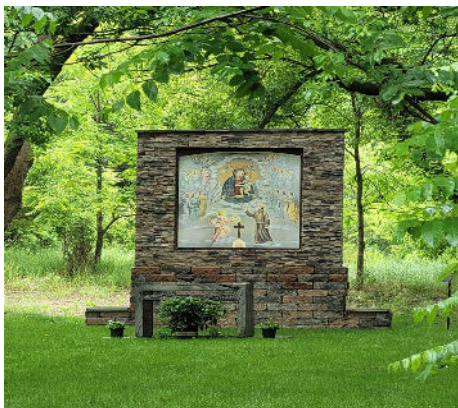
Image of Our Lady of Grace with Altar