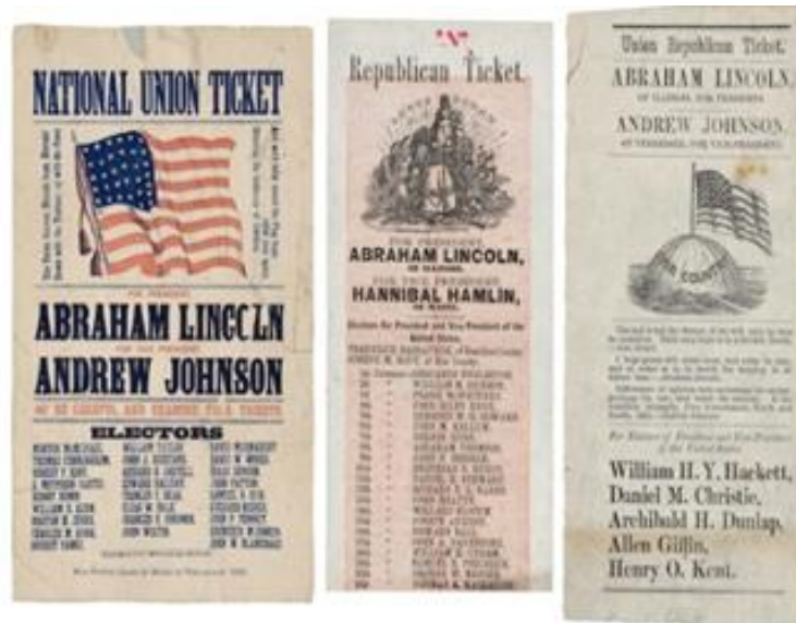
19 Party tickets for the Republican/National Union party and candidate Abraham Lincoln in the 20 elections of 1860 and 1864.

1 49. Party tickets had the same vulnerabilities as voice voting to rewards 2 and retaliations corrupting the voters' individual, free choices. They were supplied 3 by political parties and had contrasting colors so that it was simply a matter of 4 observation to know which ballot the voter slipped in the box, as shown below in 5 the images from the elections of 1860 and 1864 involving Abraham Lincoln. 6 There was no secrecy and thus ample opportunity for a voter's choices to be 7 influenced by promises of rewards or fears of retaliation for voting deemed 8 "incorrect" by others—employers, guilds, or trade associations.