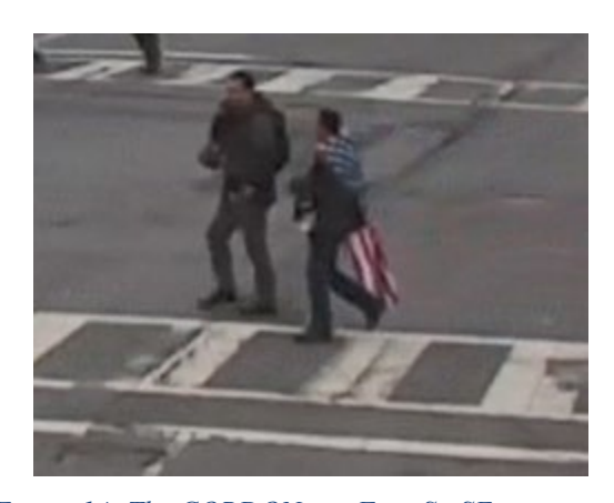
Figure 14: The CORDONs on First St, SE.

• 3:03 PM: The CORDONs depart north along First Street, SE.