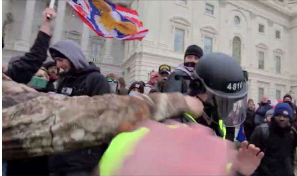
Gov't Ex. 16 (cropped).

to rejoin the larger group of withdrawing officers. Gov't Ex. 12, 16. Government Exhibit 16 shows the punch.