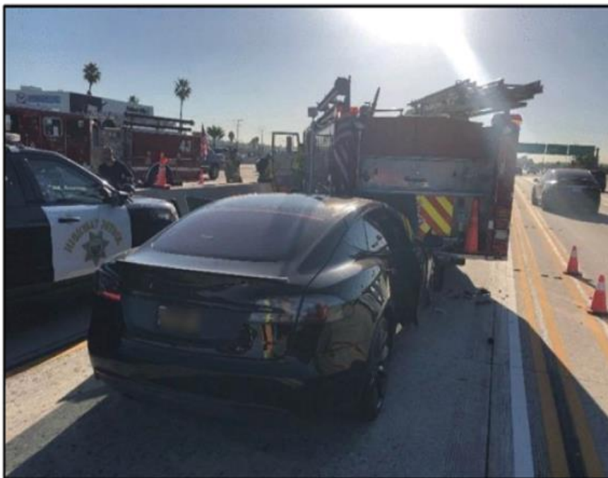
26 Figure 1. View of crash scene showing striking vehicle in HOV lane behind fire truck, southbound 27 I-405, Culver City, California. 28