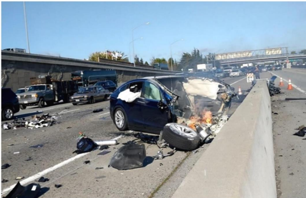
22 Figure 7. Northbound view of the crash scene before the Tesla was engulfed in flames. (Source: 23 witness S. Engleman)

7 [r]equirements are needed for driver monitoring systems for advanced 8 driver assistance systems that provide partial driving automation (SAE 9 Level 2 systems), and Tesla needs to develop applications that more 10 effectively sense the driver’s level of engagement and that alert drivers 11 who are not engaged. 19 (Emphasis added.)