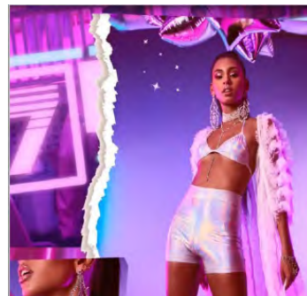
Forever 21’s look-alike model with identical “7” in the background