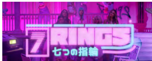
26 7 Rings logo from Ms. Grande’s 27 music video

20 30. Examples of Defendants’ unauthorized posts depicting Ms. Grande’s 21 look-alike are included below, and attached hereto as Exhibit 3 :