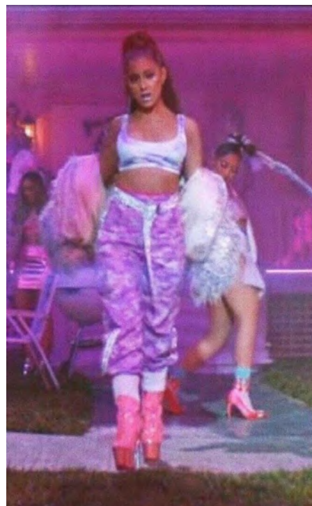
Image of Ms. Grande from 7 Rings music video