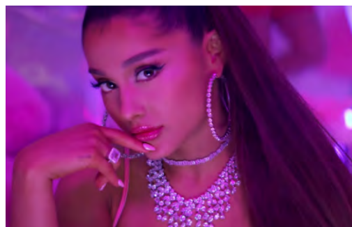
Images of Ms. Grande from 7 Rings video