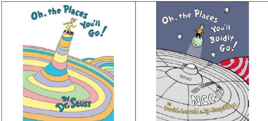
(FAC ¶ 37.)