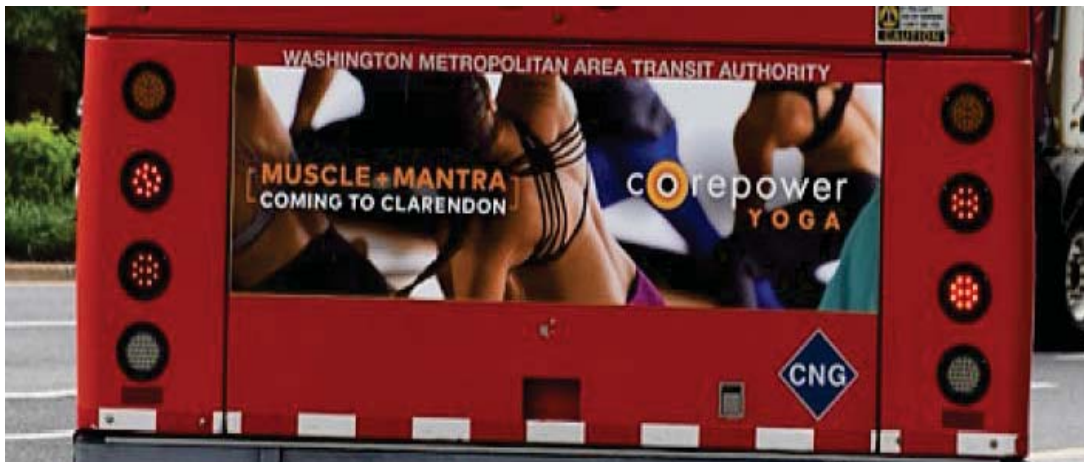
Exhibit F to Bowersox Decl.

CorePower Yoga is a chain selling memberships to “yoga fitness studios” that offer “unique” hybrid workouts called “yoga-based fitness classes.” See https://www.corepoweryoga.com/ . The ad announcing the opening of a new location does not promote any religion or religious practice or belief. 16